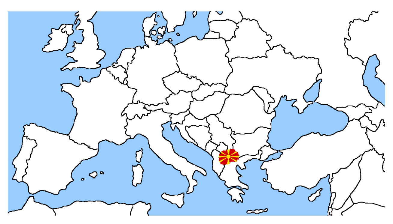
Figure 1. Location of The Republic of Macedonia